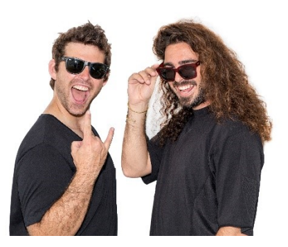
#DontStopTheMusic Don't forget to tune in! No matter where you're staying in, the music will still come to you

Wedemark/Germany, April 20, 2020 – Sennheiser's #DontStopTheMusic series continues with superstar DJ Luciano, Mambo Brothers, Wingenfelder and many more – all playing live from different parts of the world via @sennheiser on Instagram. Here are all the performance dates until the end of the month.